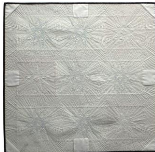
View of back of artwork